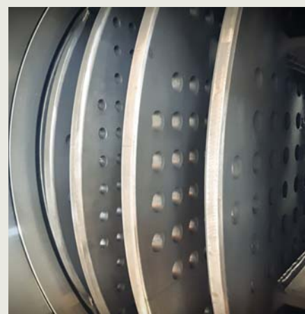
Close-up of the special caged trim in the Key-C rotary control ball

Yes, we have run a dynamic performance comparison with a ball control unit, first actuated with the Cable Drive actuator and